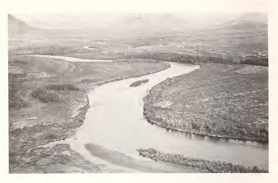
Fig. 2. The Togiak River and drainage, August 1973.

black spruce, Picea mariana ; paper birch, Betula papyrifera ; and balsam poplar, Populus balsamifera ) are found on the main valley floors and lower hills and slopes (Fig. 3). Broken tracts of alder ( Alnus spp. ) and willow ( Salix spp. ) are found throughout the area beyond timberline (Fig. 4). Tamarack ( Larix laricina ), black spruce, aspen ( Populus tremu -